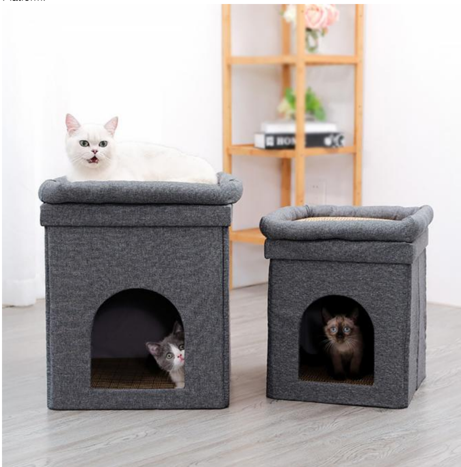
MULTIFUNCTIONAL FOLDING CAT LITTER

This cat climbing frame is the perfect solution for pet owners looking to provide their cats with a luxurious and comfortable space to play and relax. Its versatile design and high-quality construction make it a popular choice among cat owners. Treat your cat to the ultimate in comfort and entertainment with our Cat Climbing Frame Folded Double Cool Cat Litter Cathole Platform.