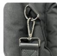
Metal quad buckle