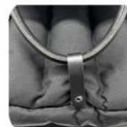
Tight and adjustable