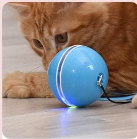
• Blue •