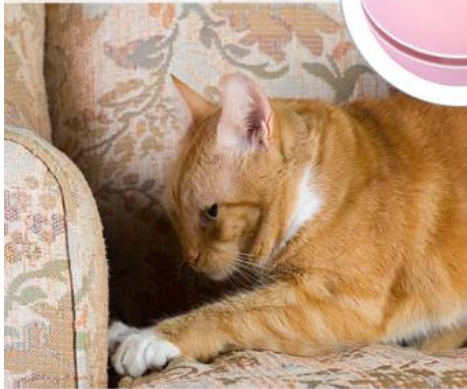
Scratch Sofa Floor