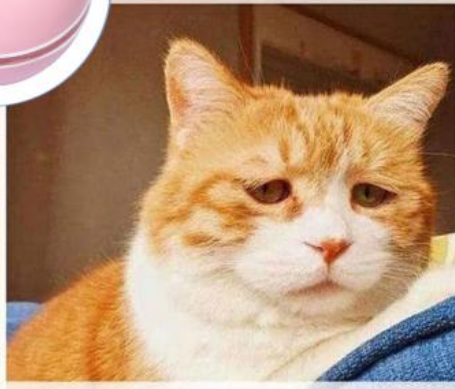
Obesity due to lack of exercise

Caution: The ball rolls the best on hard floor, might not roll well on thick carpet