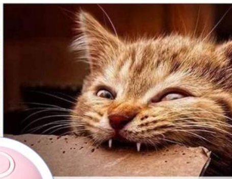
Bad Chewing Habit