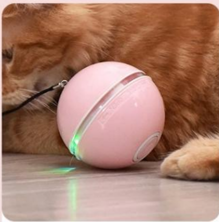
• Pink •