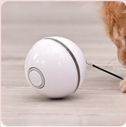
• White •