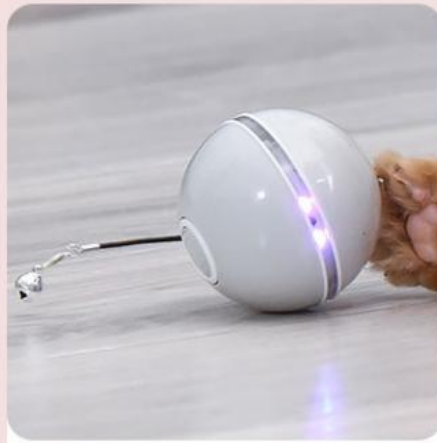
• Grey •