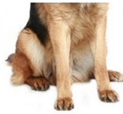
Large breed dog