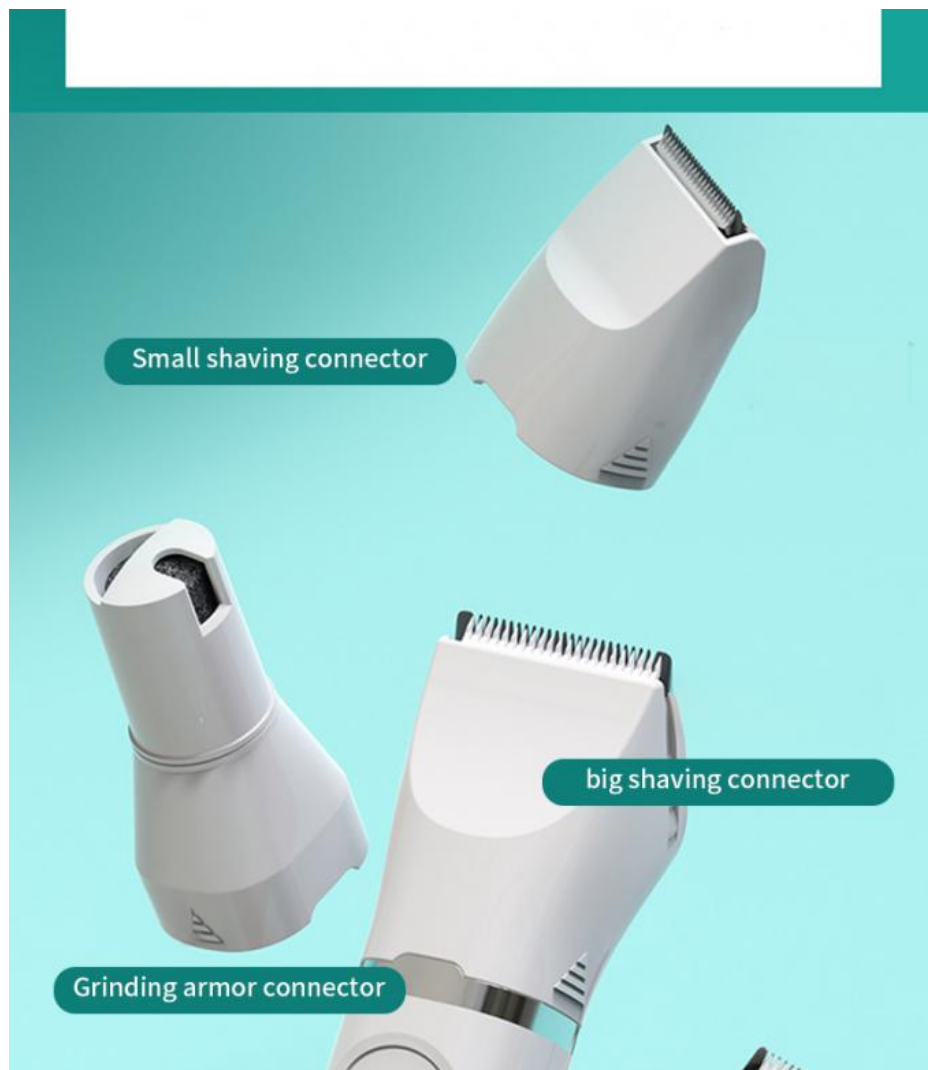
Small shaving connector