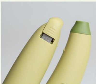
Open the detachable file.