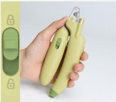
Use the nail clippers to turn off the blood line lamp, Close the safety lock and keep it properly.