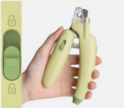
Open the nail clipper safety lock