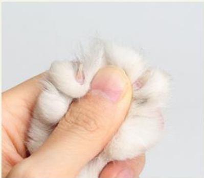
Gently press the pad of your pet's paw to reveal the nails