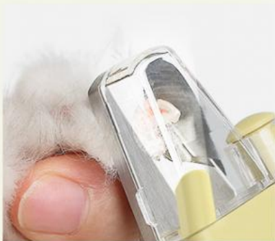
Open the side LED light illuminate the bloodline and trim the transparent nails