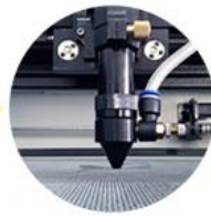
Cutting of pattern