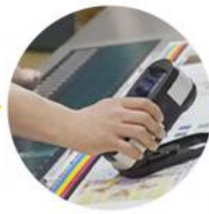
Pattern range confirmation