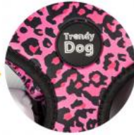
Stitching Brand label