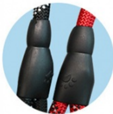
Strong protective sleeve