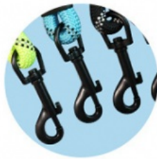
Preferred metal buckle