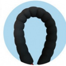
The foam handle