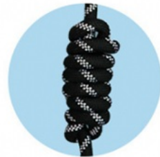
Wear resistant nylon rope