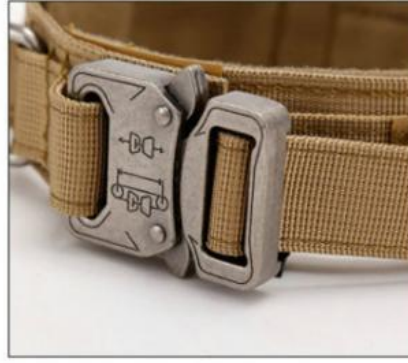
Insert alloy buckle