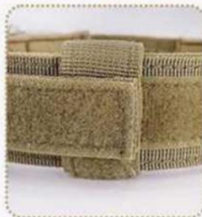
2 Retaining ring