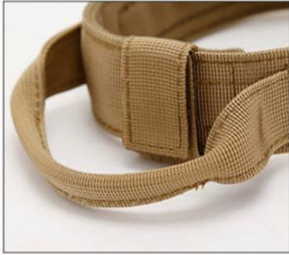
Thickening of the handle