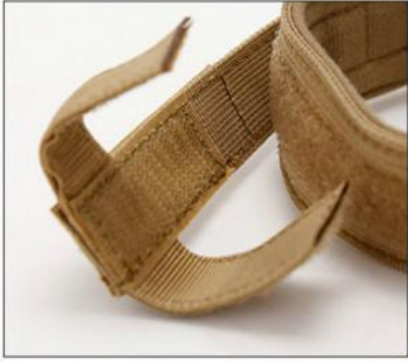
Hook & loop