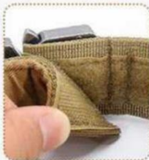
1 hook and loop