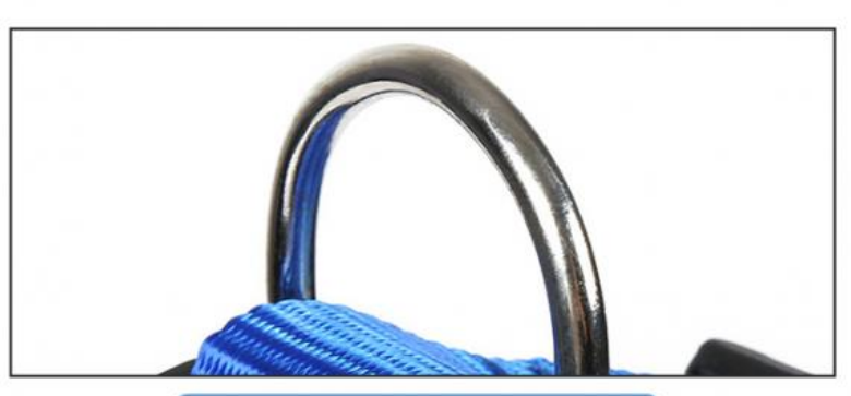
Reinforced iron, D-shaped traction buckle