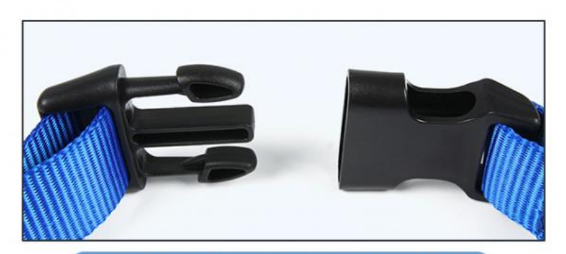
Engineering buckle to prevent slipping, not easy to slide