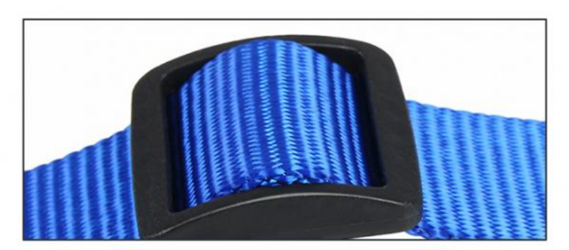
Engineering day buckle, size adjustment at will