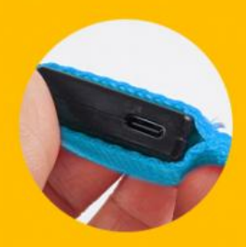
Charging Port Cover the port to stop water from entering the battery